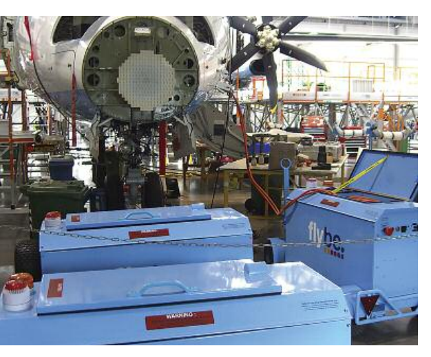
Coolspool 580: Q400 – supplying power during heavy maintenance

4-cable 70 mm (3in) section 4-metre (13ft) double-insulated output cable (for minimum voltage drop under very heavy load)